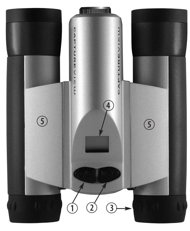
Fig. 1: Top View